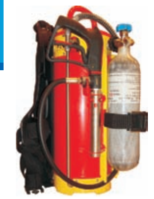
ASKA Hand Held + Back Pack