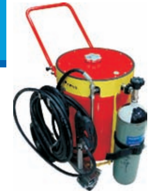
ASKA Trolley Mounted